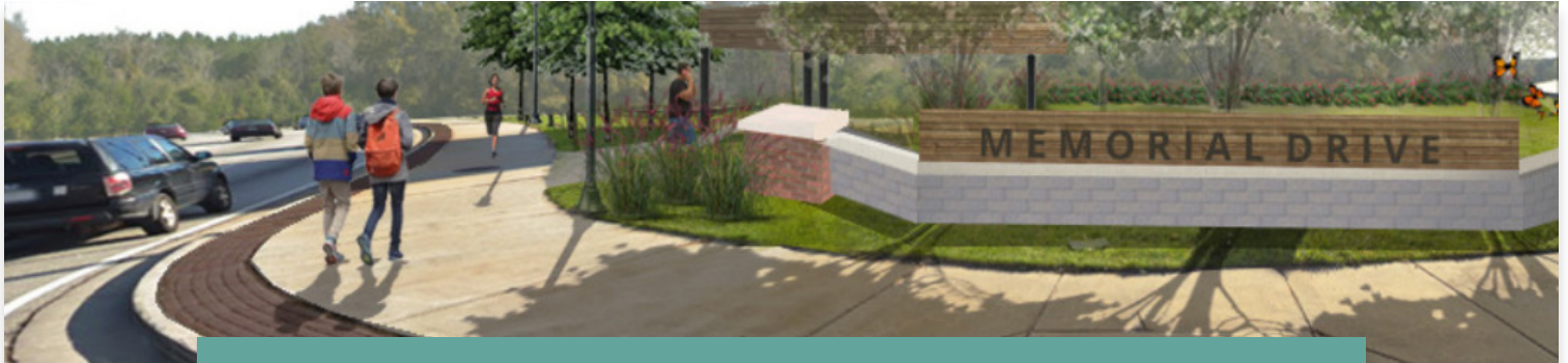
Meeting with constituents to discuss the Memorial Drive Revitalization Corridor Plan.